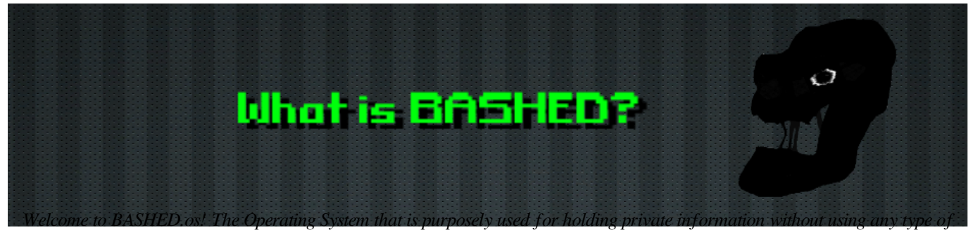
data-transferring to past by! No connection to the Wi-Fi will never EVER work. At least properly.

Why is it useful? BASHED.os is useful for small managing uses, not once will you ever be hacked, not ONCE will you ever be tracked! Unless manually installed to the HDD provided to you. The hacks of course, will never happen. Other than that, everything provided to you will start with a notepad, and a file-browsing system! What's useful? To keep these files hidden, and protected. These will be used for slight hidden purposes. Making a movie? Make sure nobody gets access to this! Save to the HDD, and hide the device!